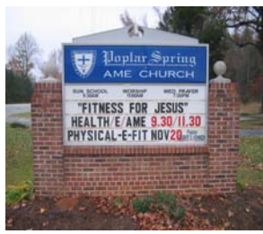
A warm welcome from Poplar Springs AME in Laurens

The Health-e-AME Physical-e-Fit program is heading into the 3rd year of existence and has been offered to churches across the state!