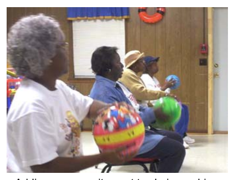
Adding some excitement to chair aerobics class with exercise balls

In March, their walking club led a walk-a-thon for 30 people during the Black Church Week of Prayer for the Healing of AIDS. During Vacation Bible School in June, physical activity